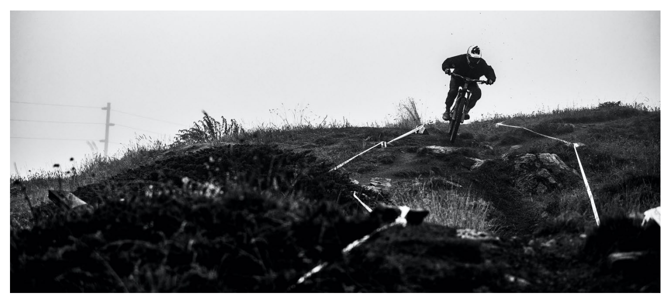
Figure 1 Tape on both sides close to the ground protected from wind

If there are two pieces of tape on either side of the trail, the rider must ride between them. In these areas, crossing or bypassing the tape is considered a shortcut.